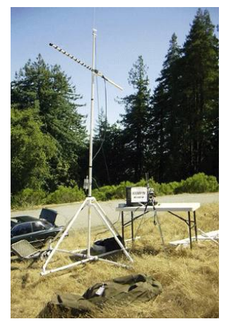
A close up view of my video field setup.