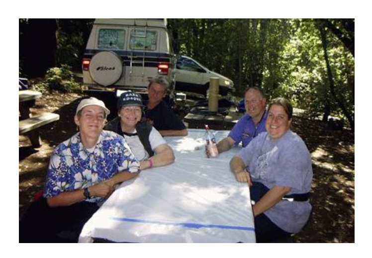
SCCARA members, these are just a few, there were many others.

I drove to Valley View Drive a half-mile away and this site overlooks the Santa Clara Valley. However, there were a set of trees that made my video transmission (1.2 GHz) to the K6BEN difficult. I did manage to make a very brief link to the repeater but for only a few minutes. I did not know I was successful at the time because it was difficult to see the screen on my TV set as the sun was so bright.