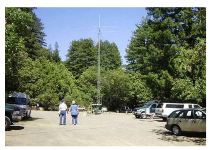
An overview of the Manzanita campground with the tower trailer holding the HF yagi. Many of the stations used simple dipoles strung across the open area between trees. I could not transmit video from the Manzanita campground because of too many trees. At both sites on Mt. Madonna it was difficult to see the K6BEN output (421 MHz).