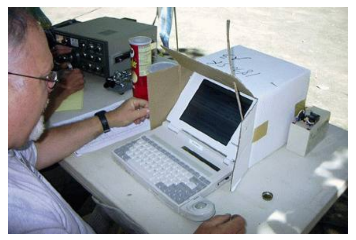
A closeup view of one of the laptops used for tracking contacts. Cardboard shields against the bright sunlight. Almost all stations had a second person with a laptop as station contact rate was quite high.