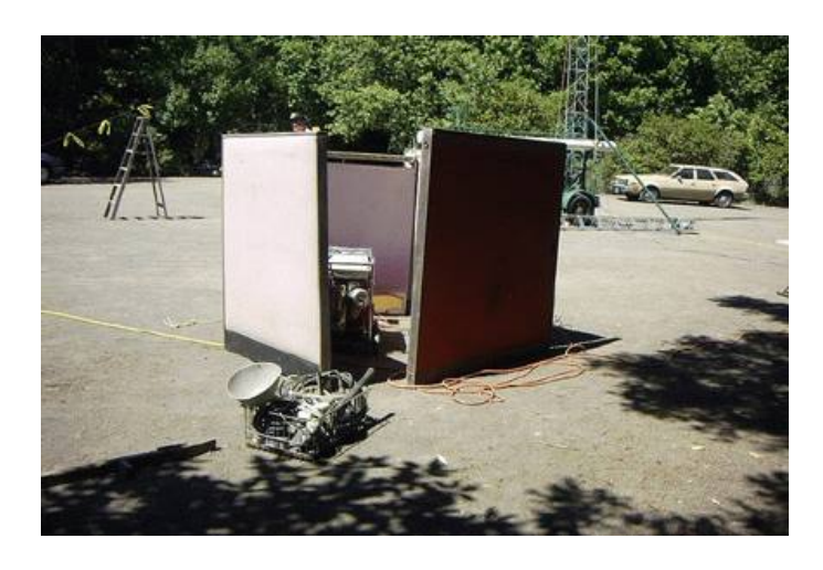
SCCARA's AC generator surrounded by cubicle walls to reduce engine noise. This generator and several DC car batteries supported power needs, SCCARA stations were all based on "emergency power."